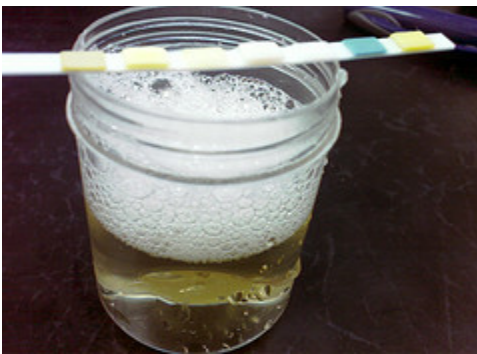
Protein in urine presenting as frothy urine

GN may be a temporary and reversible condition, or it may get worse. Progressive GN may lead to chronic/advanced kidney failure. Those patients who have only blood in the urine with no significant urine protein usually have a better outcome. However, those patients with excessive amount of urine protein or if the kidney biopsy shows significant damage to the kidney at the time of diagnosis, they are more likely to develop kidney failure with time. The time it takes for GN to cause kidney failure is usually many years. As most of them are asymptomatic and patients feel well, many are not aware they have GN or may have defaulted treatment in their early stages. The opportunity to control the illness is then missed as mild case without treatment can progress to a more serious stage with all the associated kidney failure complications. Remember, the whole process usually occurs over a long period of time, thus follow up and compliance with treatment are essential in preventing kidney failure.